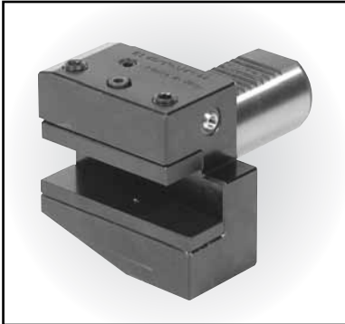
Toolholder with parallel shank and transversal rectangular seat, right-hand short