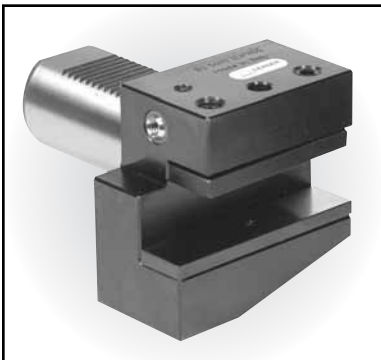
Toolholder with parallel shank and transversal rectangular seat, left-hand short